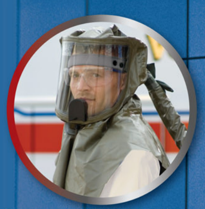
Sentinel XL<sup>™</sup> CBRN PAPR NIOSH CBRN Approved TC-23C-2312