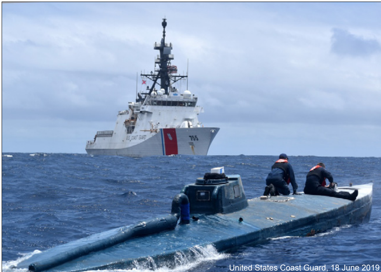
United States Coast Guard, 18 June 2019