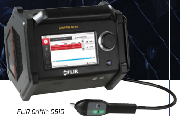
FLIR Griffin G510

The FLIR Griffin G510 GC-MS enables responders to confidently identify unknown chemical threats. It is the ultimate chemical detection toolbox, with guided controls and simple threat alarms. Completely self-contained and mission-ready, the G510 is built for everyone and everywhere.