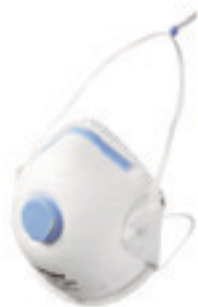
X-plore 1360 with exhalation valve

The new Dräger X-plore 1300 Series Respirator includes a unique head strap tension adjuster, which allows the wearer to fine-tune the mask to the proper comfort. In addition, the Dräger X-Plore 1300 is available in two sizes and utilizes a comfort seal around the nose. The non-irritating textile straps will not pull your hair and the color coded nose clip helps you to quickly identify the protection level. Available in N95 and R95 with or without comfort valve, as well as N95 nuisance OV odor control.