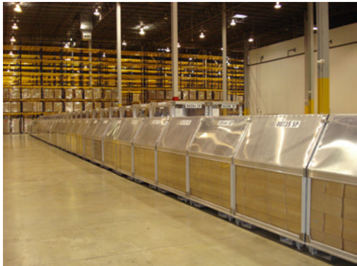
Specialized cargo containers were designed for the 12-hour Push Package to improve delivery speed and efficiency.

On 1 March 2003, the Homeland Security Act of 2002 took effect, and the stockpile was transferred from HHS to the Department of Homeland Security (DHS). At the same time, the National Pharmaceutical Stockpile was renamed the SNS to reflect its evolving formulary to store more than just pharmaceuticals, but also medical supplies and devices earmarked for public health emergencies. Additionally, formulary governance in the early years was established by the stockpile via the creation of the Intragovernmental Committee, chaired by CDC's associate director for science and made up of members from various federal organizations including HHS, CDC, FDA, DoD, and DHS.