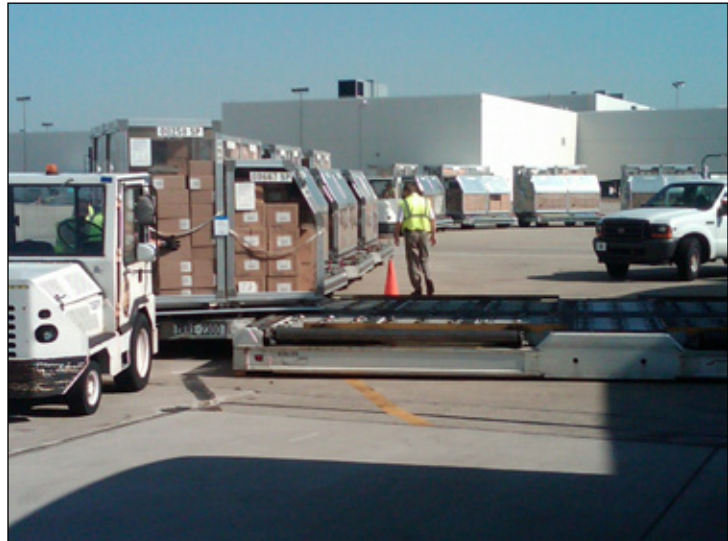
Cargo containers specially designed for SNS products in the stockpile's early years are still in use today. The shape allows for better configuration for air cargo transport (Source: Strategic National Stockpile, date unknown).

One of the stockpile's first collaborative efforts with emergency response planning was working with the New York City Department of Emergency Operations and the Federal Aviation Administration. On 11 September 2001, one month after the three organizations