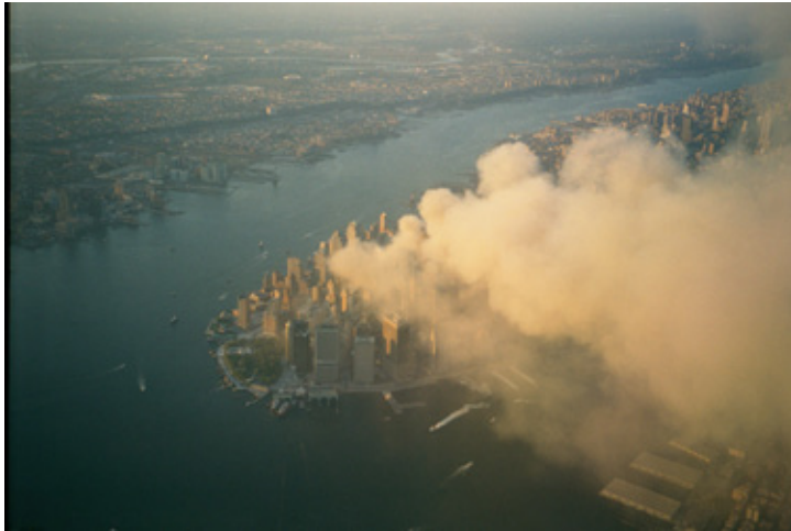
Aside from Air Force One, the only other aircrafts in U.S. airspace following the 9/11 attacks were flights to NYC to deliver stockpile medicines, supplies, and personnel (Source: Strategic National Stockpile, 2001).

staged their first full-scale exercise, an early morning attack on the World Trade Center and the Pentagon confirmed the country's worst fears. The stockpile was called into action as part of the government's immediate response to the deadliest terrorist attack on U.S. soil. Within seven hours of the order to deploy to New York City, the stockpile delivered by both ground and air cargo a 12-hour Push Package of medicines and supplies as well as ventilators, ancillary supplies, and burn-and-blast supplies. The delivery was met by a response team of stockpile experts called a Technical Advisory Response Unit, which was able to deploy to New York via chartered aircraft. On that day, the only other non-military flight in U.S. airspace was Air Force One.