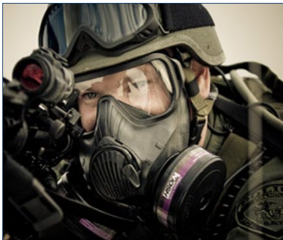
The C50 CBRN mask provides high protection, outstanding field of vision and superior comfort. The C50 was developed for the military and law enforcement communities requiring NIOSH (National Institute for Occupational Safety and Health) or CE certifications, making it the most versatile choice available for purchase by law enforcement, government agencies, hazmat and first responders.

But establishing the standards is only part of the process – the equipment still must be tested, independently and under real-life conditions. Approvals are therefore based on positive results from rigorous tests carried out by accredited third-party testing entities. The NIOSH tests for